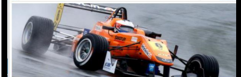
Felix Rosenqvist.