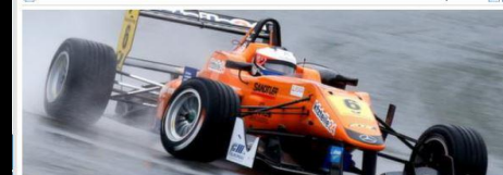
Felix Rosenqvist.