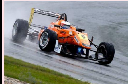
Drömmar om F1 21-åriga Felix Rosenqvist ligger tvåa i EM inför helgens tävlingar. Nu hyllas han av den förre världsmästaren Damon Hill.

Rosenqvist jagar F1: "Ni har en bra förare på gång"