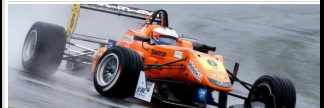
Felix Rosenqvist.